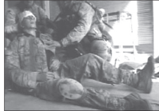
US soldier wounded in Fallujah.

abandon Iraq, leaving behind the corpses of a few of their mercenaries. For example, KBR, a Halliburton affiliate, stated that thirty percent of its personnel had been killed.