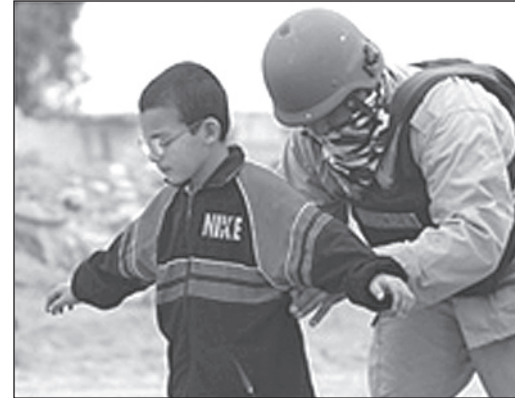
A child undergoes a search in Fallujah.

structures. When social revolution pounds on history's door with all its might, the gangs of exploiters choose to forget their immediate interests, for a time, of course, and rally behind the faction that is most capable and well-equipped for defending capitalism. The global state is precisely this process in motion, always in gestation, that breaks up and establishes itself increasingly more powerfully, expressing the organization of capital in a dominating force, in the force of exploitation that has a greater and greater need to impose its social order in every part of the world, monopolizing violence and keeping it in the hands of the ruling class. The greatest worry of capital's global state is that the permanent catastrophe that it generates will unflinchingly provoke violent, armed, uncontrolled reactions ... that it must continually attempt to smother in order to maintain its rule. The difficulty of reasoning in terms of individual countries in such situations is clear, because the reality of this process often surpasses the commonly acknowledged division