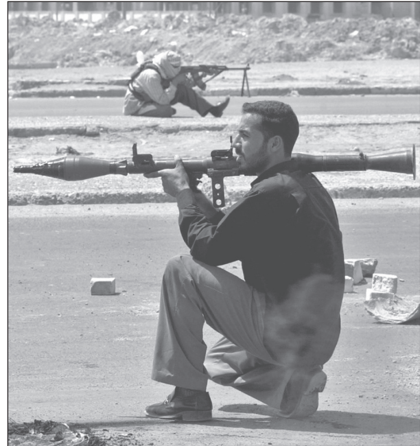
Iraqi soldiers refused to die for the Hussein regime yet retained their weapons after deserting the army to return to their families.

What no army could have done – i.e., making things difficult for the greatest military power in the world – a social guerrilla struggle is managing to do. From the attacks against military convoys to those against embassies and general headquarters, from the assaults against the new Iraqi police to the sabotage of pipelines and refineries, from the lynching of marines to mass strikes, now no one can swallow the lie of a population that loves the “liberating and peace-bringing” soldiers. No one who has a minimum