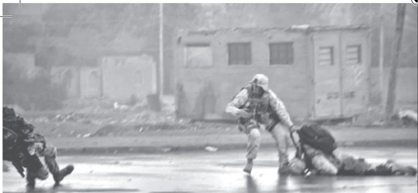
A sniper attacks US troops in Fallujah.

advertising techniques to draw in the desperate. Promises of job training and benefits combine with images of power in which the protagonists are proud and determined young people of all colors, presenting the impression that the military can offer the dignity missing from the lives of the poor. In addition, the Pentagon targets specific ethnic and racial groups among the exploited with more pointed publicity. An example that exposes the kinds of methods used can be found in the recruiting campaigns aimed at poor Latin American immigrants within the US.