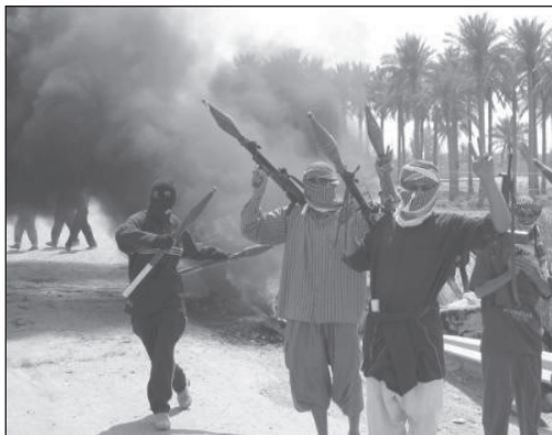
Iraqi resistance fighters.