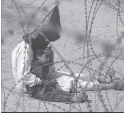
Iraqi prisoners being detained by Coalition forces.