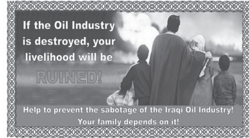
Coalition psychological warfare leaflet.