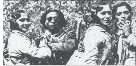
Cangaceiros dancing in the sertão.