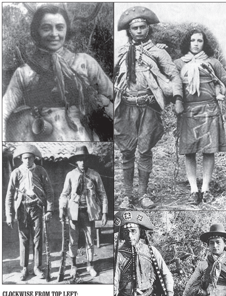
CLOCKWISE FROM TOP LEFT: Maria Bonita; Pancada and Maria Jovina; Lampião and a cangaceira ; Lampião and a cangaceiro .

human society. This is an excellent reason! They really struggled against progress, progress in the world of capitalist thought.