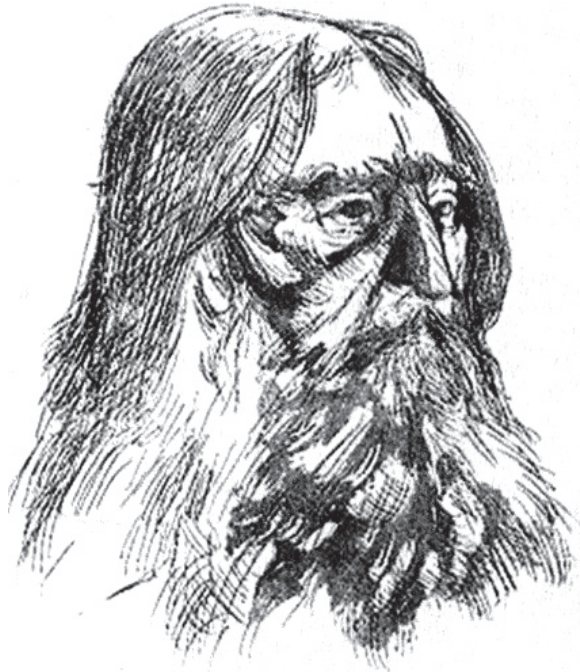
Antonio Conselheiro, “the Counselor”.

“Let the faithful, then, abandon all their worldly possessions, anything that might defile them with the faintest trace of vanity. All fortunes stood on the brink of imminent catastrophe, and it was useless and foolhardy to endeavor to preserve them.” 6