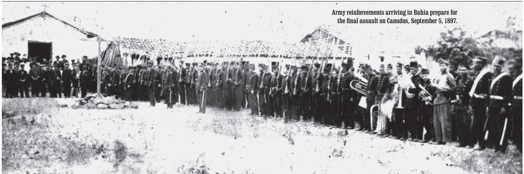
Army reinforcements arriving in Bahia prepare for the final assault on Canudos, September 5, 1897.