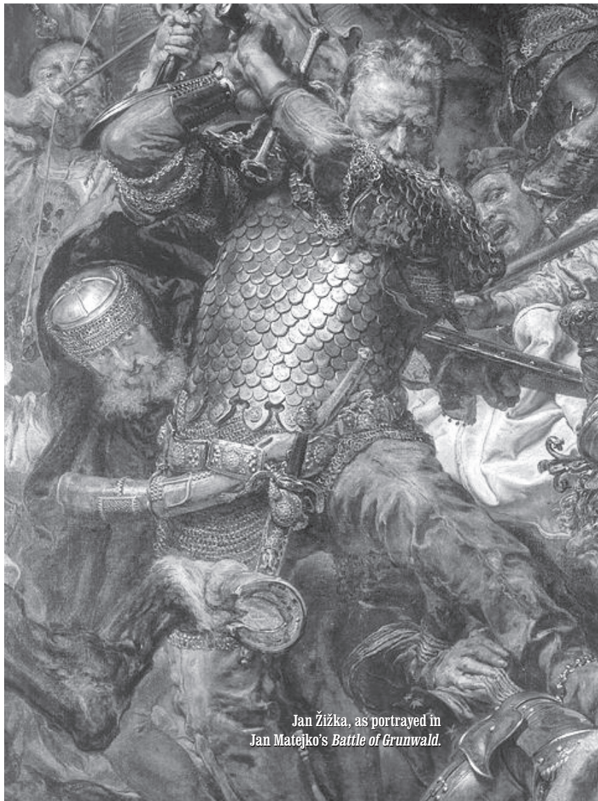
Jan Žižka, as portrayed in Jan Matejko's Battle of Grunwald .

campaign in order to dispose of the Piccards. The survivors took refuge on an island in the Nezarka river from where they carried out constant nocturnal raids: "He who is not with us is against us." They were exterminated on October 21, 1421.