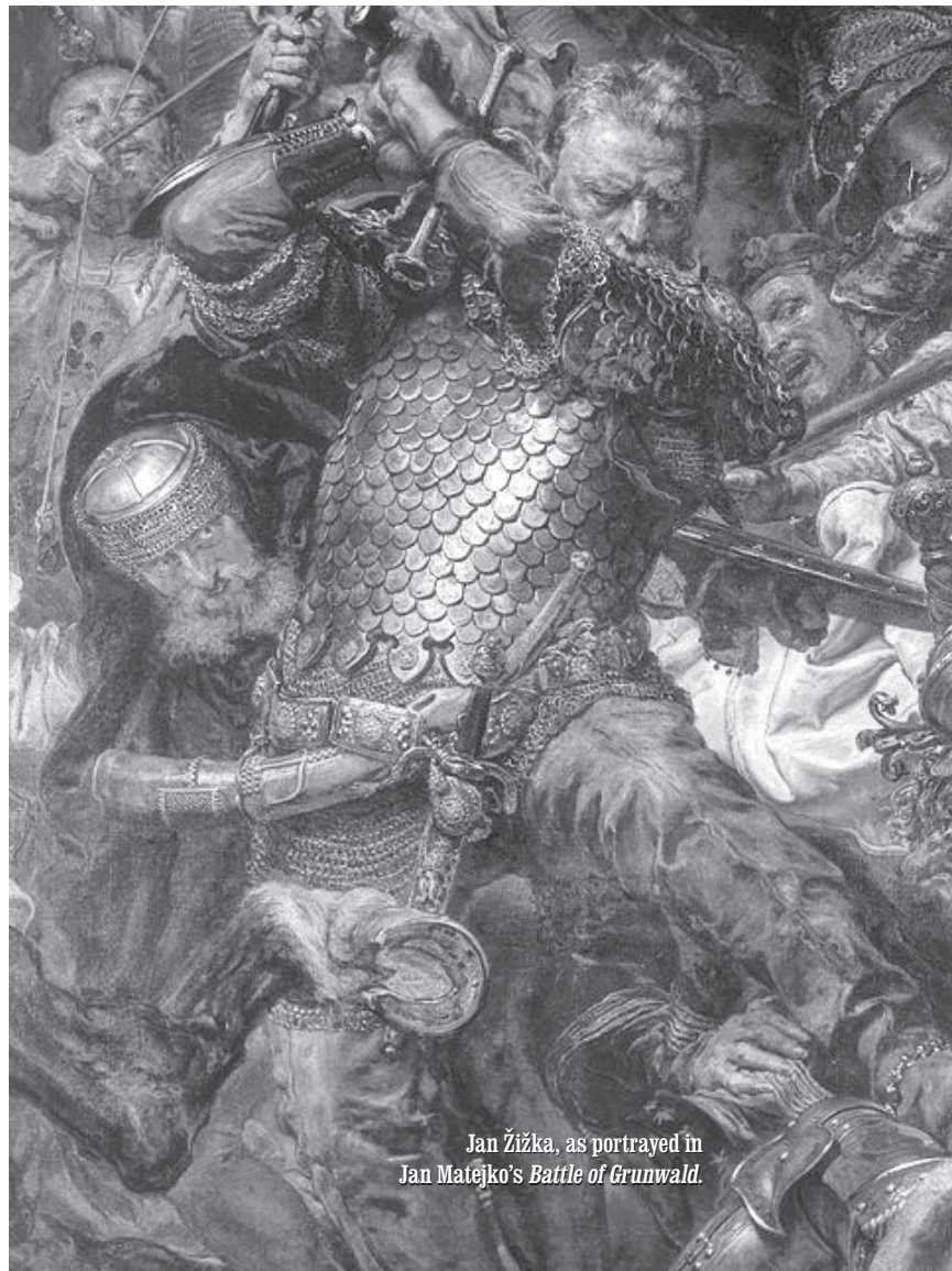
Jan Žižka, as portrayed in Jan Matejko's Battle of Grunwald .

campaign in order to dispose of the Piccards. The survivors took refuge on an island in the Nezarka river from where they carried out constant nocturnal raids: "He who is not with us is against us." They were exterminated on October 21, 1421.