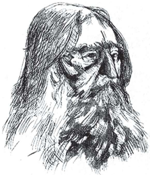
Antonio Conselheiro, “the Counselor”.

“Let the faithful, then, abandon all their worldly possessions, anything that might defile them with the faintest trace of vanity. All fortunes stood on the brink of imminent catastrophe, and it was useless and foolhardy to endeavor to preserve them.” 6