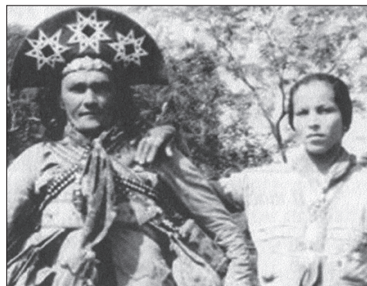
Corisco and his partner Dada.

THE CANGACEIRO GAVE EVIDENCE IN HIMSELF of the possibility of shaking off the yoke of oppression, which is neither invincible nor eternal. Judgment can always fall, unexpected, upon the rich and powerful. The cangaceiro only caused the pieces to be put back in play, also showing that the struggle is pitiless and that freedom must be conquered . The cangaceiro was energy directed toward a new form of life. All things considered, the cangaceiro was the revolution.