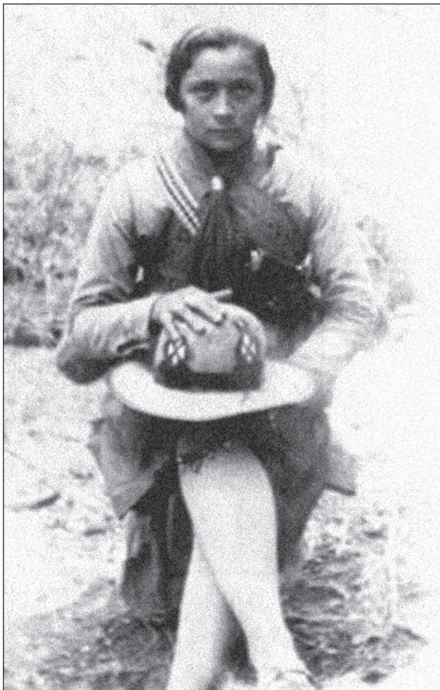
Maria Bonita, partner of Lampião.

devouring mile after mile of the sertão . 41