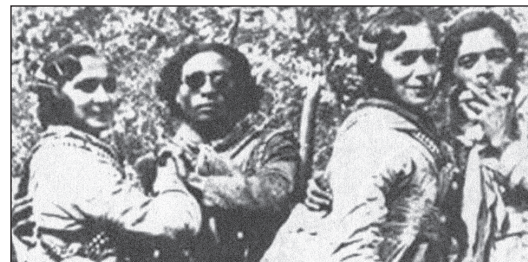
Cangaceiros dancing in the sertão.